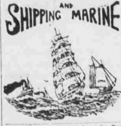
The British ship Yola left up for Portland Sunday.