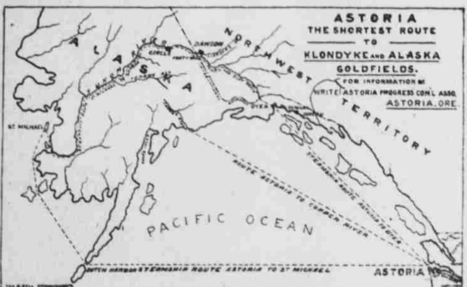
FOR THE ENVELOPES.

Oriental Novelties Japanese Goods WING LEE 643 Commercial Street