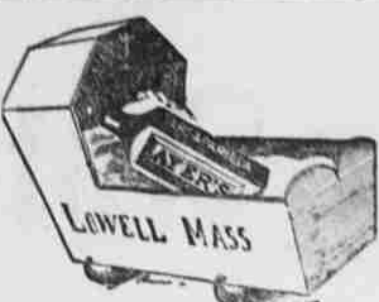
Lowell Mass. Fifty Years Ago.

NO-TO-BAC GUARANTEED CURE FOR TOBACCO HABIT. Over 1,000,000 boxes sold.