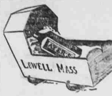
Fifty Years Ago.