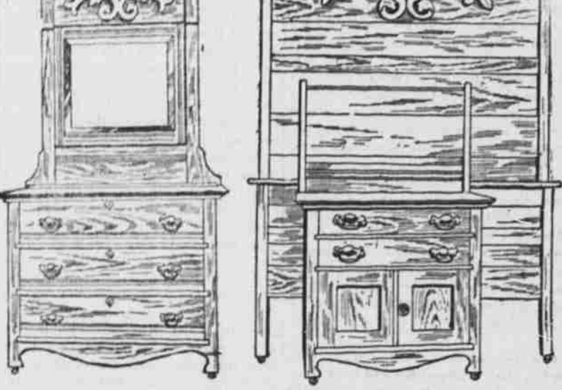
This Chamber Suit, hardwood finish in maple, light birch or XVI century.