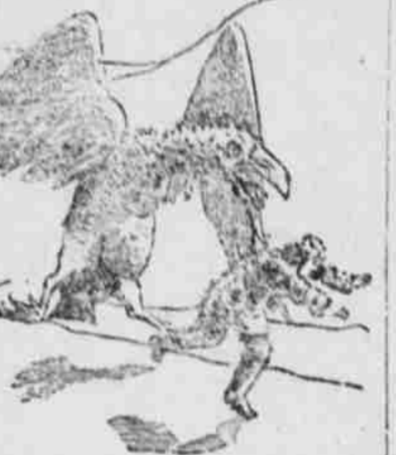
The "Greatest Ever" and one of the Real Attractions.