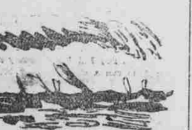
A STEAMER WAS CROSSING OUT.

The visitors left on the Gatzert in the evening, the Northern Pacific officials going to Kalama, where a special train will convey them to Tacoma.