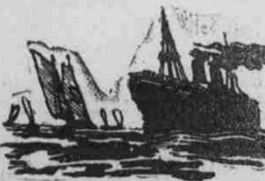
A STEAMER WAS CROSSING OUT.

The visitors left on the Gatzert in the evening, the Northern Pacific officials going to Kalama, where a special train will convey them to Tacoma.