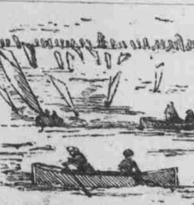
AND THE FISHING FLEET WAS COMING IN.

Chicago Record: Proprietor of the Summer Resort—I don't see what we're to do. Last year we hadn't many guests, and there aren't any prospects that we'll have many this year.