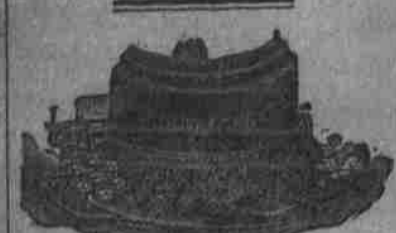
Western Union Telegraph Office, DuBois, Pa., July 17, 1892.