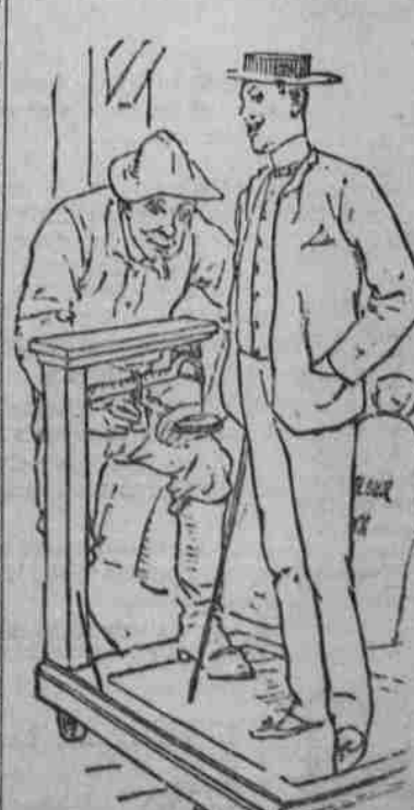
(Gaining Every Day.)

it the only enfectioned against the many diseases incidiously promulgated by ordi-