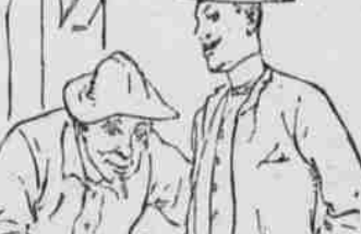
(Gaining Every Day.) Put your lips around one of the Senator Stanford or the Schiller Cigars, then light it and draw. What do you find? The finest two for a quarter on the Coast, and they are gaining new customers every day.

Special attention paid to steamboat repairing, first-class horseshoeing, etc. LOGGING CAMP WORK A SPECIALTY. 197 Olney street, between Third and Fourth, Astoria, Or.