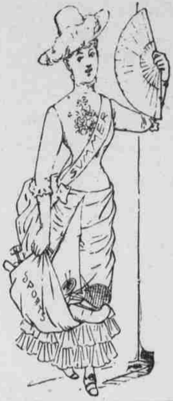
FOOTBALL CLUB NOTES.