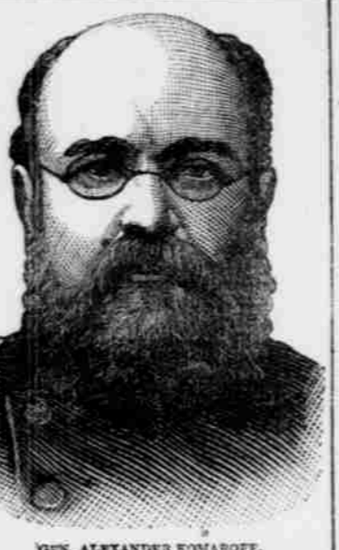
GEN. ALEXANDER KOMAROFF.