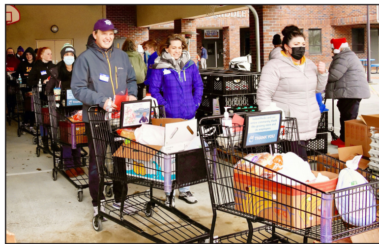
Soroptimist of Florence and area volunteers distributed hundreds of boxes of food to local families on Dec. 18 as part of the annual Christmas Baskets program.