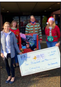
Community donates to students INSIDE — A3