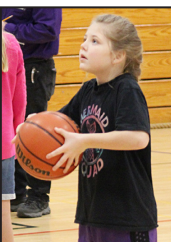
Elks host Hoop Shoot INSIDE — B