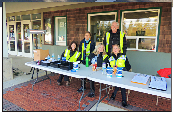
FEMA and Oregon Health Authority worked with the City of Florence to bring a Mobile Vaccination Unit to Florence this week. The agencies are offering a free drive-through clinic at the Florence Events Center for people seeking initial and booster doses of the Pfizer, Moderna and Johnson & Johnson vaccines.