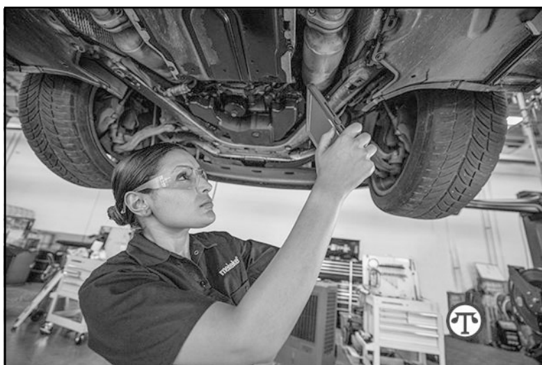
Vehicles today are too complex for most drivers to do their own repairs. Fortunately, there are plenty of professionals in Kentucky who can help.

by Kevin Leger (NAPSI)—When it comes to taking care of cars, all those countless “do it yourself” videos make it all seem so straightforward and easy. So, too many people take matters into their own hands, only to realize after they’ve taken everything apart, only a trusted mechanic can fix the problem. As cars are becoming more advanced, it’s important to visit your automotive repair shop for professional car care. Here’s a list of seemingly simple but actually complex repairs you shouldn’t try at home.