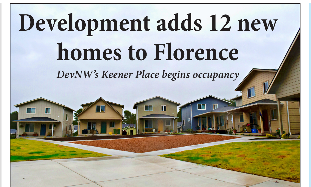
DevNW has officially opened Keener Place, 1424 Airport Road, for occupancy, bringing 12 "cottage cluster" style homes to Florence and creating affordable housing with a community land trust.