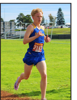
Siuslaw claims wins in three sports INSIDE — B