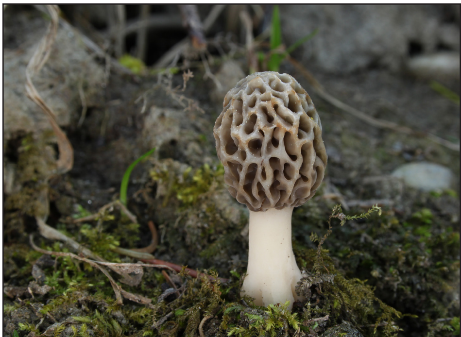
The most popular mushrooms found in Oregon are morels (above), golden chanterelles, king boletes and American matsutakes.

One of the main reasons that nine of the 25 best counties for foraging were located in the Northwest is the abundance of forests, heavy rainfall and