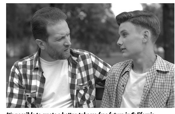
It's possible to create a better, tobacco-free future in California. You can start by talking to your kids about the dangers of flavored tobacco.

Nicotine addiction is especially dangerous for kids. It rewires the brain to crave more of it, creating nicotine withdrawal symptoms including headaches, mood swings and the inability to concentrate.