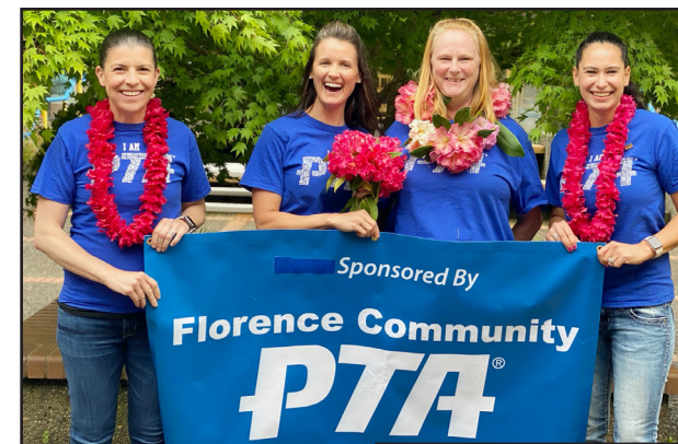
Florence Community PTA has been active in the area since Oct. 29, 1991.

"The PTA was instrumental in showing a need for the Siuslaw News to produce the new monthly newsletter for the local schools. PTA members volunteer their time at the schools to support the staff. They interact with the teachers, principals, and administrators. They hold a Teacher Appreciation Week, in addition to having a carnival and a talent show for the kids. The PTA would love for you to volunteer your time, but if you don't have time to spare, you can show your support by joining the association. You don't even have to have kids to be a member or vol-