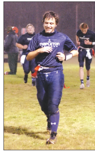
Mapleton put together a combined middle/high school team to play flag football on Friday against McKenzie.