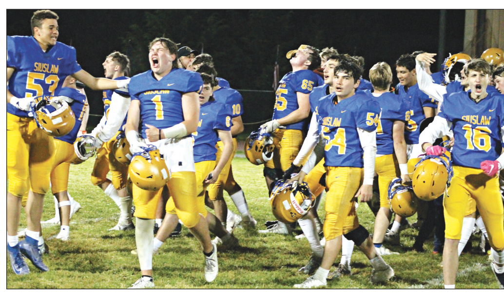
The Vikings celebrate another dramatic victory at home. The Vikings are 6-0 and sit in first place in their division.

Siuslaw moves to top of OSAA rankings with tight win over La Pine