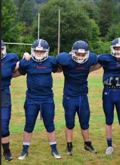
Mapleton football changes gears INSIDE — B

RECORDS Obituaries & emergency response logs INSIDE — A2