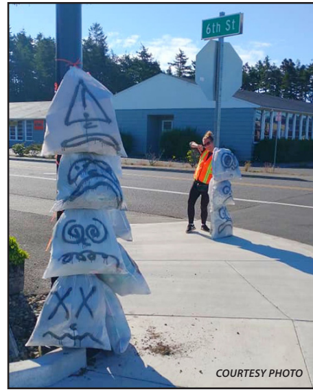
Leaven No Trace seeks to clean up the area of litter. After bagging trash, the group then installs the bags in prominent places, including sidewalks.