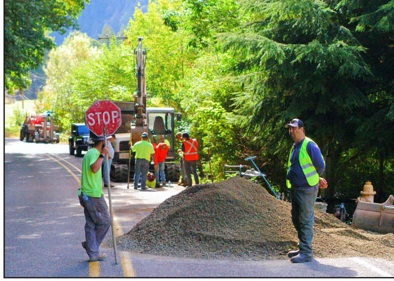
Workers from Delta Operations, of Eugene, assist Mapleton Water District workers on leak repairs on East Mapleton Road.