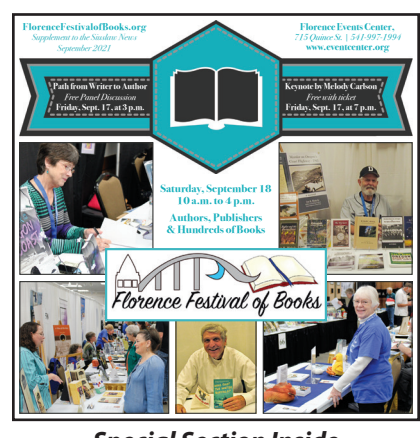
Special Section Inside