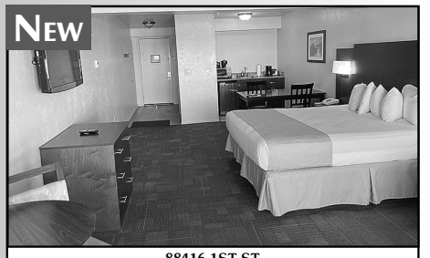
88416\ 1ST\ ST OCEANFRONT INVESTMENT OPPORTUNITY. This A unit is newly remodeled and centrally located on the property. Top floor location with spectacular ocean views from every angle. This rare "kitchenette model" is spacious with dining table/chairs, king bed & sleeper sofa. Bathroom features a walk-in shower The property offers a restaurant and lounge, indoor swimming pool, hot tub & a children's play area. Great opportunity to own oceanfront property with resort living on the Oregon Coast. $149.900 #12250 MSL#21615427

CUSTOM HOME, MINUTES TO BEACH. Heated garage with an open floor plan. Lighted horseshoe pit and plenty of room in the backyard for play and entertainment. Cozy and well-designed home on a quiet cul-de-sac that provides plenty of privacy. Distinctive features and amenities not often found. Make this your home today. $495,000 #12251 MLS#21192854