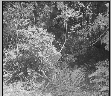
TL#1900 SHORE CREST DR

in Rhodoview Dunes. This is a gated community of upper-end view homes. All utilities are stubbed in and the lot is ready to build with good overal topography for the subdivision. This lot is just ninutes from downtown and close to the Oce Dunes Golf Course. This lot is ready for your dream home! $89,000 #12227 MLS#21642292