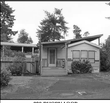
209 RHODY LOOF

Great getaway spot nestled in the trees and natural vegetation. Large patio/deck area with small storage shed. All items in travel trailer are included Small seasonal creek alongside and back of lot prevent permanent structure. Trailer cover ramada. $98,500 #12205 MLS#21281253