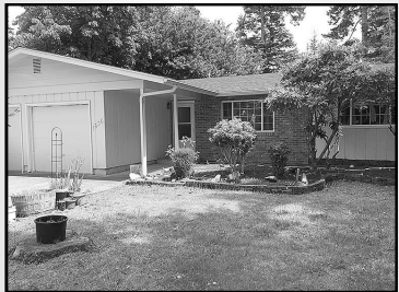
1636 W PARK DRIVE

2002 Palm Harbor triple-wide MH with attached oversized garage, including 44' RV space. Home has many upgrades and has been very well maintained. New roof in 2013, leaf filter gutter protection, tie downs, vinyl siding and so much more. Home is tastefully decorated and pacious with outstanding quality - it's a must-see