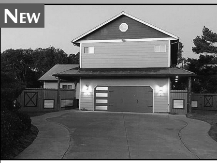
87942 LIMPIT LANE

CUSTOM HOME, MINUTES TO BEACH. Heated garage with an open floor plan. Lighted horseshoe pit and plenty of room in the backyard for play and entertainment. Cozy and well-designed home on a quiet cul-de-sac that provides plenty of privacy. Distinctive features and amenities not often found. Make this your home today. $495,000 #12251 MLS#21192854