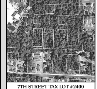
Streets are plotted but no roads exis to this property. It is undeveloped. Buy now, develop later or now. POI zoning allows for high density housing. Buyer to check with City of Florence for all ac-

Great corner lot sits just above the fish hatchery & nearby Rock Creek. Located close to the outdoor recreation and fishing of the North Umpqua River. Well and septic are on site. Spring water still flow ing, as well as, water source for the pond Partially developed building site. Buyer perform due diligence. $125,000 12213 MLS#21255658