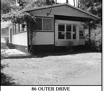
86 OUTER DRIVE

This is a unique property with a spacious addition of 2 large rooms and a utility room. There is a private, fenced patio area with an outdoor fireplace and a storage shed. $25.00 transfer fee to be paid by buyer at close of escrow. $135,000 #12155 MLS#21432860