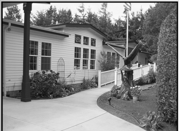
406 SHERWOOD LOOP

Brand new Pacific Northwest style 1-level home close to beach and recreational areas. Soaring vaulted ceilings in main living area, covered private back patio, pre-wired for hot tub on patio granite and SS kitchen, large master suite w/walkin closet. All 1 level w/ no steps. Garage pre-wired for electric charging station. Low maintenance landscaping. Quality throughout. Make this new home yours today! $514,900 #12161 21450495