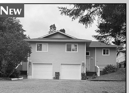
1630/40 13TH STREET

GREAT LOCATION...CITY VIEWS...DUPLEX. Are you looking for an exceptional duplex? Same owner for 26 years with newer roof, paint and exterior siding. Each unit is 2 bedrooms with 1.5 baths and one car garage. Great private location with south facing city views from a private deck. $419,000 #12247