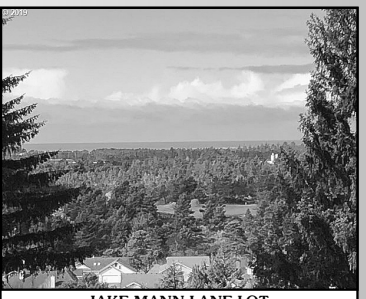
JAKE MANN LANE LOT

Rare and coveted 65x120 multi-family zoned lot in the heart of the city. Build your next project here! HR (High Density Residential) Zoning in-fill lotniently close to everything; bank, shopping dining. No others like it currently available. Du tri-plex?? Check with city for permitted multi-family uses. $98,500 #12167 MLS#21337692