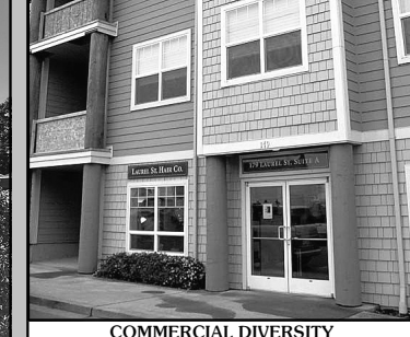
COMMERCIAL DIVERSITY Calling all lawyers, stylists, accountants,

Great commercial property centrally located in town. Long term tenant. 5 year lease with 3%annual lease increase. 83X120 corner parcel. Great redevelopment opportunities long term. $329,900 #12240 MLS#21682685