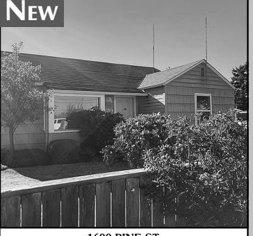
1699 PINE ST

FLOATING HOME! Easy access to the lake, ma rina and boat launch. Beautiful, stunning views all around: a unique opportunity. Private setting Fun, useful amenities throughout the home. Fish $89.900 #11700 MLS#18209847