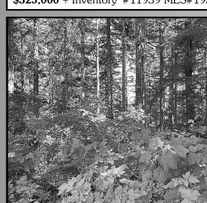
TL#1800 SHORE CREST DR

Don't pass up this great opportunity to build on this nice wooded lot with utilities at the street. This is a nice private setting just minutes to Old Town, the beach and Sutton Lake is just around the corner. Great lot with mature timber and ready to develop. $62,000 #12222 MLS#21644765