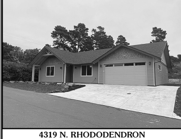
4319 N. RHODODENDRON

Contingent upon seller finding suitable replacement The current family has made extended bedrooms which can be removed upon closing, if desired. Large deck, lots of living space, access to a walking path at rear of the lot. Shown by appointment only. Buyer to pay $25.00 transfer fee at close of escrow. $195,000 #12245 MLS#21411669