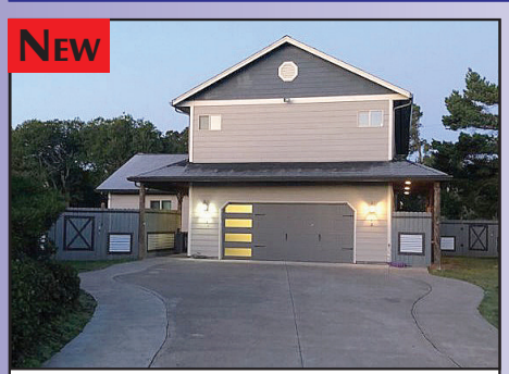
87942 LIMPIT LANE

CUSTOM HOME, MINUTES TO BEACH. Heated garage with an open floor plan. Lighted horseshoe pit and plenty of room in the backyard for play and entertainment. Cozy and well-designed home on a quiet cul-de-sac that provides plenty of privacy Distinctive features and amenities not often found. Make this your home today. $495,000 #12251 MLS#21192854