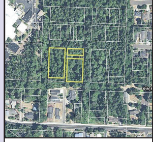
7TH STREET TAX LOT #2400

Great corner lot sits just above the fish hatchery & nearby Rock Creek. Located close to the outdoor recreation and fishing of the North Umpqua River. Well and septic are on site. Spring water still flow ing, as well as, water source for the pond Partially developed building site. Buye to perform due diligence. #12213 MLS#21255658