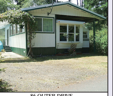
86 OUTER DRIVE

This is a unique property with a spacious addition of 2 large rooms and a utility room. There is a private, fenced patio area with an outdoor fireplace and a storage shed. $25.00 transfer fee to be paid by buyer at close of escrow. $135,000 #12155 MLS#21432860