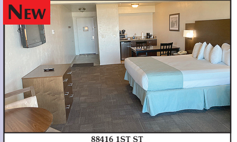
OCEANFRONT INVESTMENT OPPORTUNITY. This A unit is newly remodeled and centrally located on the property. Top floor location with spectacular ocean views from every angle. This rare "kitchenette model" is spacious with dining table/chairs, king bed & sleeper sofa. Bathroom features a walk-in shower The property offers a restaurant and lounge, indoor swimming pool, hot tub & a children's play area. Great opportunity to own oceanfront property with resort living on the Oregon Coast $149,900 #12250 MSL#21615427

CUSTOM HOME, MINUTES TO BEACH. Heated garage with an open floor plan. Lighted horseshoe pit and plenty of room in the backyard for play and entertainment. Cozy and well-designed home on a quiet cul-de-sac that provides plenty of privacy Distinctive features and amenities not often found. Make this your home today. $495,000 #12251 MLS#21192854