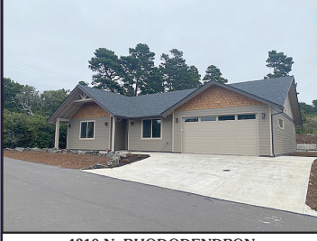
4319 N. RHODODENDRON

Brand new Pacific Northwest style 1-level home close to beach and recreational areas. Soaring vaulted ceilings in main living area, covered private back patio, pre-wired for hot tub on patio granite and SS kitchen, large master suite w/walk-in closet. All 1 level w/ no steps. Garage pre-wired for electric charging station. Low maintenance landscaping. Quality throughout. Make this new home yours today! $514,900 #12161 21450495