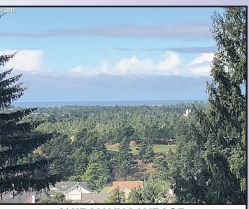
JAKE MANN LANE LOT

Rare and coveted 65x120 multi-family zoned lot in he heart of the city. Build your next project here! HR (High Density Residential) Zoning in-fill lotconveniently close to everything: bank, shopping, dining. No others like it currently available. Duplex, tri-plex?? Check with city for permitted multi-family ses. $98,500 #12167 MLS#21337692