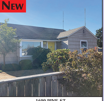
1699 PINE ST

FLOATING HOME! Easy access to the lake, marina and boat launch. Beautiful, stunning views all around; a unique opportunity. Private setting Fun, useful amenities throughout the home. Fish from your living room! Great weekend get-away $89,900 #11700 MLS#18209847