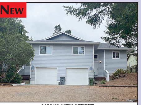
1630/40 13TH STREET GREAT LOCATION...CITY VIEWS...DUPLEX. Are you looking for an exceptional duplex? Same owner for 26 years with newer roof, paint and exterior siding. Each unit is 2 bedrooms with 1.5 baths and one car garage. Great private location with south facing city views from a private deck. $419,000 #12247 MLS#21037886