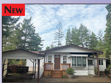
40 EASY STREET Contingent upon seller finding suitable replacement property The current family has made extended bedrooms which can be removed upon closing, if desired. Large deck, lots of living space, access to a walking path at rear of the lot. Shown by appointment only. Buyer to pay $25.00 transfer fee at close of escrow. $195,000 #12245 MLS#21411669