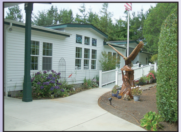
406 SHERWOOD LOOP

Brand new Pacific Northwest style 1-level home close to beach and recreational areas. Soaring vaulted ceilings in main living area, covered private back patio, pre-wired for hot tub on patio granite and SS kitchen, large master suite w/walk-in closet. All 1 level w/ no steps. Garage pre-wired for electric charging station. Low maintenance landscaping. Quality throughout. Make this new home yours today! $514,900 #12161 21450495