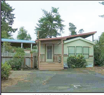
209 RHODY LOOP

Great getaway spot nestled in the trees and natura vegetation. Large patio/deck area with small stor-age shed. All items in travel trailer are included Small seasonal creek alongside and back of lot prevent permanent structure. Trailer cover ramada. $98,500 #12205 MLS#21281253