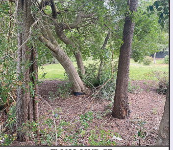
TL2600 22ND ST

munity. Vacation now, retire later, or start living your dreams. Located on a cul-de-sac at end of River Vista Drive, this 0.54-acre lot has poten tial distant river/ocean views. Don't miss this unique opportunity for affordable living on the Oregon coast. Amenities include a clubhouse nis & bocce ball courts, jacuzzi, sauna & outdoor pool. Close to medical facilities, library, shopping & Old Town. $88,000 #12136 MLS#21513355