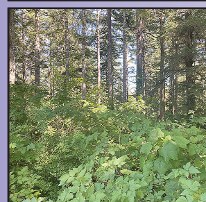
TL#1800 SHORE CREST DR

TL#1900 SHORE CREST DR Don't pass up this great opportunity to build on this nice wooded lot with utilities at the street. This is a nice private setting just minutes to Old Town, the beach and Sutton Lake is just around the corner. Great lot with mature timber and ready to develop. $62,000 #12222 MLS#21644765