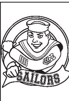
Sailors start six-man football INSIDE — B