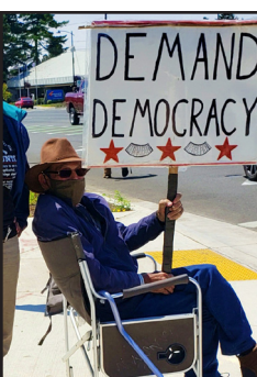
Rally supports "For the People" Act INSIDE — A3