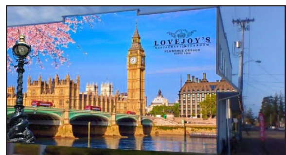
The proposed mural at Lovejoy's Restaurant and Tea Room on Nopal Street may need modifications before final approval.

"The applicant proposes an approximately 960-square-foot mural painted directly on the south wall of the building containing Lovejoy's Restaurant and Tea Room," she said. "The south wall of the restaurant immediately faces a retail building and the mural is to consist of a scene of London, England, specifically Big Ben, The