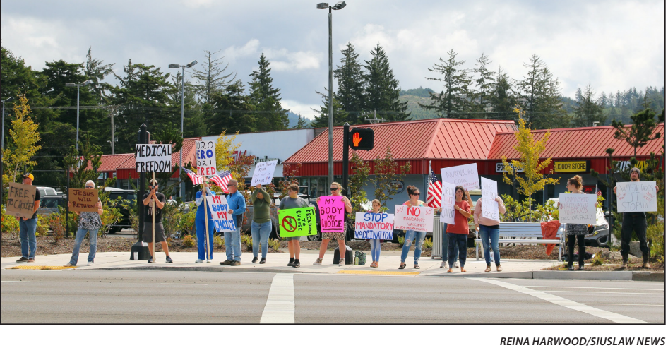
People stood at the corners of Highways 101 and 126 from 10 a.m. to 3 p.m. to show their discontent with vaccination mandates.

The local event ran from 10 a.m. through 3 p.m., with approximately 35 people who rallied, including children. Messaging on the signs included "My Body, My Choice," "Medical Freedom," "Freedom to Choose" and "Where There's Risk There Must Be Choice." One sign, carried by a woman in medical scrubs, said, "2020 Hero, 2021 Fired."