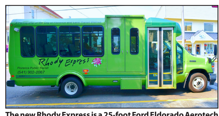
The new Rhody Express is a 25-foot Ford Eldorado Aerotech cutaway with space for more than 10 people.

serves as a central fixed route service and key transportation hub in the city of Florence and provides a connection point with other services such as the Florbut we're hoping it will last ence/Eugene and Florence/