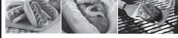
All proceeds to stay in Florence and help those in need of a free meal.