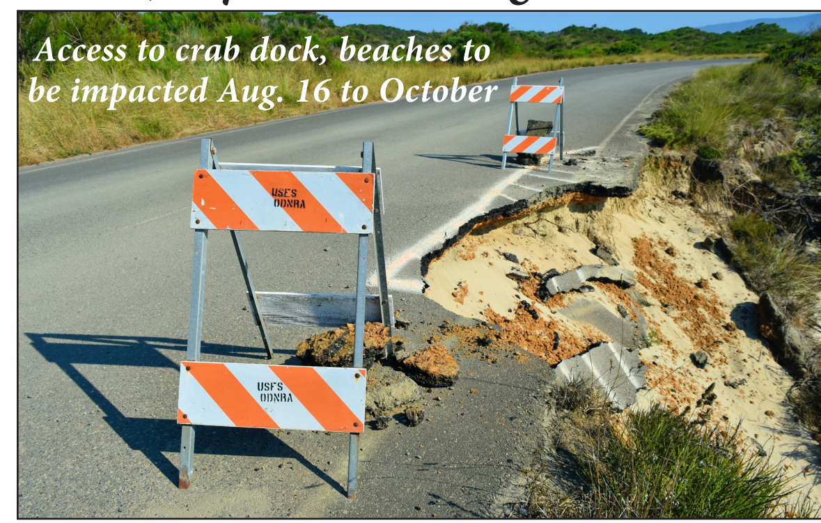
South Jetty Road will be closed north of beach access #5, which includes the crab dock and two additional beach access points, to all traffic (vehicle, bicycle, foot) from Monday through October as the road undergoes construction and repairs.