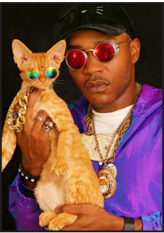
Cat Rapper appears at OCHS today INSIDE — A3