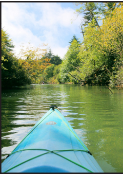
Kayak down the river INSIDE — B

RECORDS Obituaries & emergency response logs Inside — A2