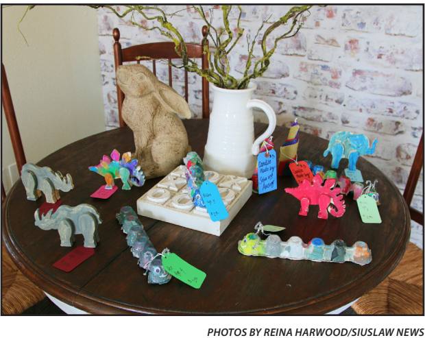
The Cottage Preschool art show included paintings, drawings, sculpture and more, which were sold to fund raise for the Oregon Coast Humane Society.