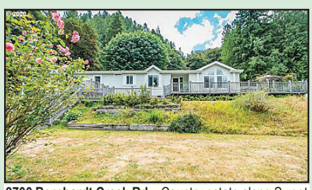
9700 Bernhardt Creek Rd - Country estate along Sweet Creek in Mapleton! Features two homes, gardens, fruit trees, barn, and private dock. Main home is 3230 sqft with an infinity pool and large wrap-around decks. The cabin comes fully furnished and is 940 sqft. $989,000. #3121-