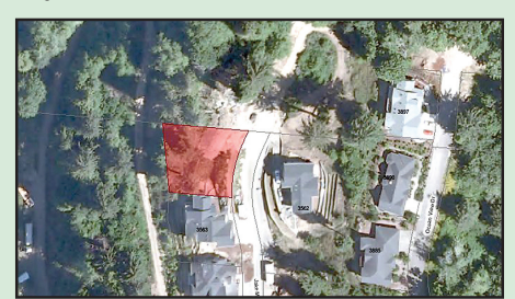
Mann Lane #8700 - Ocean and southern exposure, and gorgeous sunsets, have capti-vated many homeowners living in Rhodo View Dunes Estates. This lot is ready to build, with all utilities to the lot line and paved road to the building site. $75,000. #1875-