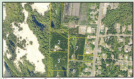
Heceta Dunes – Beautiful gated community with seven lots ranging in size from 5 to 6.47 acres. Building pad is cleared, utilities available, and the lot has septic approval. Build your dream home within minutes of dunes, lakes, and ocean! Prices range from $180,000 to $240,000.