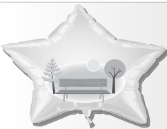
Wednesday's Graphic National Park and Recreation Month