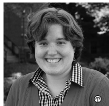
Social Security may have the ticket to success you need on the path to work.

(NAPSI)—About 40.7 million Americans have some kind of disability, according to the U.S. Census Bureau. If you or someone you care about has a disability, you may wonder what it means for employment. You may be encouraged to know that there are supports and services available that can help you or your loved ones pursue work and reach your goals through Social Security's Ticket to Work (Ticket) program.