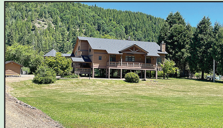
10257 Sweet Creek Rd – Private, country home with Siuslaw River views and deep water dock. 8.89 acres with timber, horse pasture, and 8 RV hookups. 30x40 shop/motorhome garage. Open living room with fireplace, wet bar and river views. $1,100,000. #3226-21130348