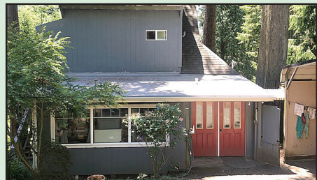
5815 Mercer Creek Dr – Unique, 4-level treehouse style home with ample parking, covered carport with 2 sheds and workshop. Stairs both inside and out, the upper and lower levels used as bdrms, creating 3 bdrm areas in total. Wonderful gardens and covered back deck. $329,000. #3222-21688495