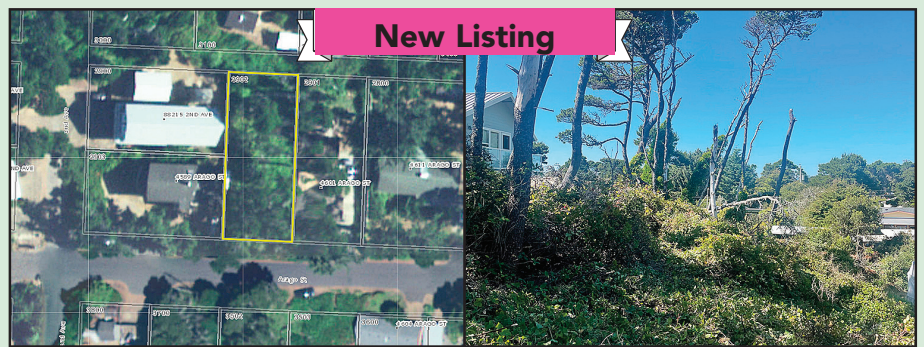
Arago St #4 – Build your dream home near the beach! This is a beautiful wooded lot with septic approval. Live within walking distance of the ocean on this .14 acre lot. $89,000. #3241-21531493