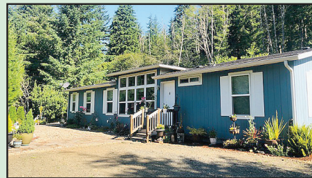
6887 Canary Rd – Home and shop on 2 acres with pasture! 3 bdrms plus den, 2 baths, large living area, breakfast nook, laundry room, large master with soaking tub. 30x40 shop with bathroom. This property has covered RV/toy storage, and creek with seasonal waterfall. $549,000. #3232-21286554