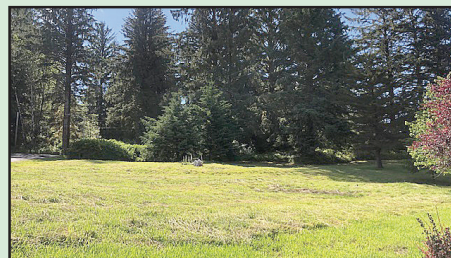
Clearwater Cove Way #2500 – This area of fine homes with partial lake views would make a wonderful site for your new home. Located in the South Lakes area on a paved cul-de-sac. Deer and all kinds of birds frequent the area. Septic approved, cleared, sunny and ready to go. $225,000. #3216-21617899