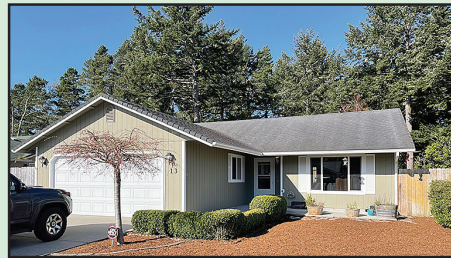
13 Park Village Dr – Wonderful, in-town 3 bdrm, 2 bath home with 1342 sqft, large open kitchen with skylights and stainless appliances, slider to covered back patio with fenced-in grounds just recently manicured. Great floor plan, extra parking in front, large backyard. $396,000. #3192-21278077