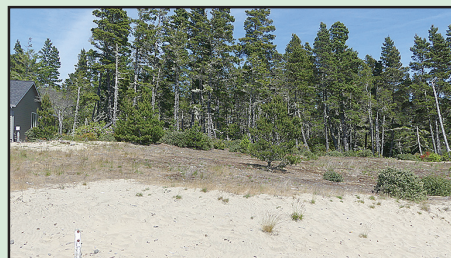
Lake Point Dr #33 – Beautiful! One-of-a-kind location with lovely wooded setting, seasonal lakes, and nature preserve areas. Partially cleared, buildable lot in The Reserve at Heceta Lake, one of Florence's most elegant neighborhoods! $147,000. #3213-21404831