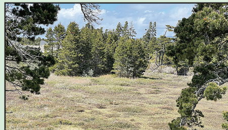
Dunewood Dr #52 – Half-acre lot in a great neighborhood with nearby park and underground utilities, including Heceta Water. $164,000. #3209-21645004