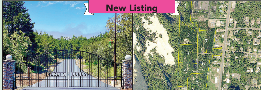
Heceta Dunes – Beautiful gated community with seven lots ranging in size from 5 to 6.47 acres. Building pad is cleared, utilities available, and the lot has septic approval. Build your dream home within minutes of dunes, lakes, and ocean! Prices range from $180,000 to $240,000. #3234-21271610