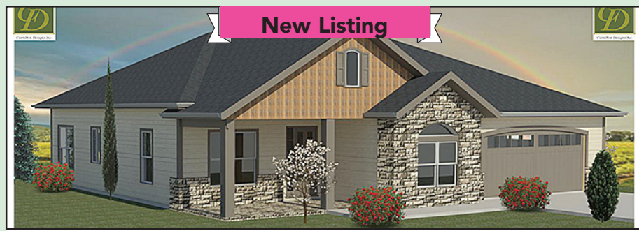
Bellevue Drive #7 – Build your dream home in Heceta Dunes, a gated community of 7 beautiful 5+ acre lots, just a mile north of Florence. Live just minutes from dunes, lakes, and ocean. Building pad is cleared, utilities available, and the lot has septic approval. Home is 2005 sqft and to-be-built. $665,000. #3240-21416548