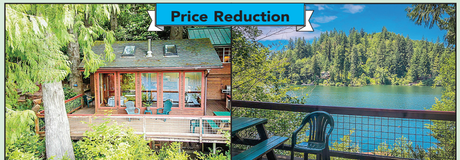
89055 Dahlin Rd – Exquisite Mercer Lakefront cabin with registered dock, on 1.19 acres. Comes fully furnished excluding boat. Knotty pine walls and ceilings, clear cedar siding, loft for sleeping area and separate bed/bath addition. Outdoor fireplace and fully stocked lake shed, including the canoe. $425,000. #3221-21487572