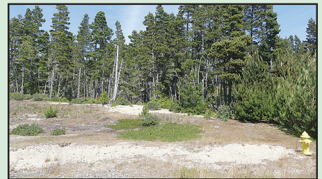
Lake Point Dr #34 – Lovely wooded setting, backing up to natural preserve areas. Partially cleared, buildable lot in The Reserve at Heceta Lake, one of Florence's most elegant neighborhoods! Beautiful development with curving streets, underground utilities, and Heceta Water. $139,000. #3214-21389818