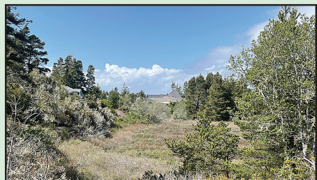
Dunewood Dr #51 – Buildable lot in The Reserve at Heceta Lake, one of Florence's most exclusive neighborhoods! Across the street from the community park area. $164,000. #3208-21058758