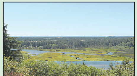
Rose Hill Rd #1300 – Incredible views of the North Fork River and valley, city and ocean on clear days. Beautiful, mature trees and flat area for a recreational getaway, or check with the County for a potential home site. This 23.23 acres is close to town yet secluded. $159,900. #3231-21211621