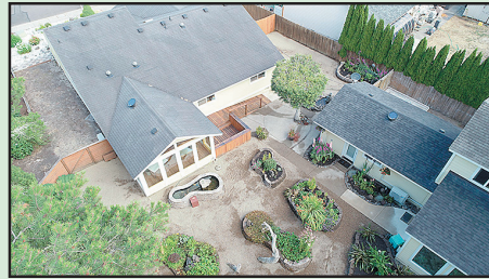
4104 Munsel Creek Dr – Two turn-key, income producing homes separated by an ever-blooming garden. Main home: remodeled 3 bdrm, 2 bath, plus 2-car garage. Secondary home: 2 bdrm, 1.5 bath with large sunroom. RV parking, security system, surround sound, so many amenities! $945,500. #3186-21117076