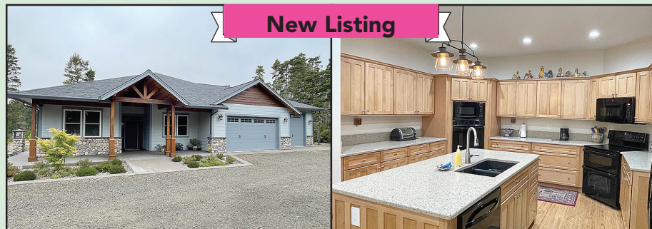
5208 Dunewood Dr – This upscale one-story, 3055 sqft home was built in 2018 on the largest lot in The Reserve at Heceta Lake. The property is wooded and has wetlands and seasonal ponds on 6.54 acres. The home sits at the end of a 400+ foot private, paved driveway. Virtual showings only. $896,500. #3229-21130566