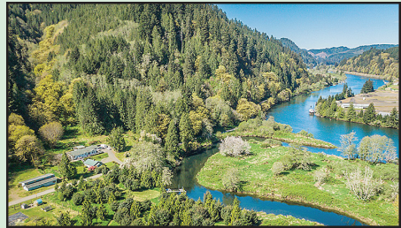
9700 Bernhardt Creek Rd – Country estate along Sweet Creek in Mapleton! Features two homes, gardens, fruit trees, barn, and private dock. Main home is 3230 sqft with an infinity pool and large wrap-around decks. The cabin comes fully furnished and is 940 sqft. $989,000. #3121-20170603