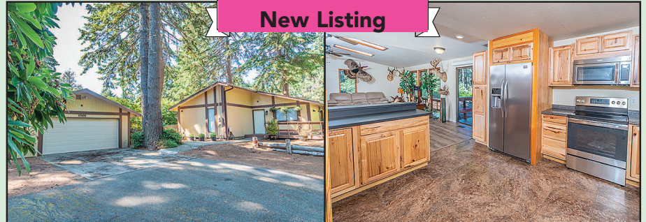
83694 Erhart Rd – Beautiful 3 bdrm, 2 bath home. Large primary suite with double sinks, jetted tub, and walk-in closet. Renovated kitchen has stainless steel appliances and custom cabinets. Private backyard with hot tub hookups. 2-car garage plus plenty of parking. $395,000. #3243-21148406