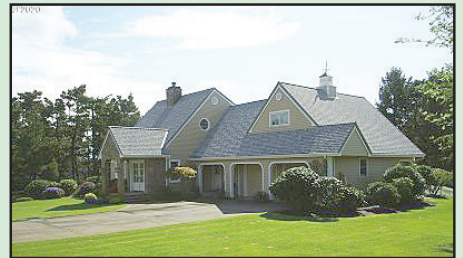
28 Ocean Dunes Dr – Custom Cape Cod home with views of the 18th green. Great room with pass-thru fireplace from kitchen to den. 2 master suites and guest room with full bath, home theater and rec room. Lot 27 is included and is the last buildable lot in Ocean Dunes. $950,000. #3124-20557608