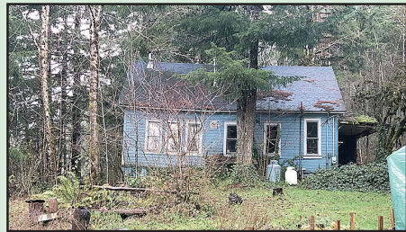
91781 Deadwood Creek Rd – Late 1800s School House, bring your skills and restore this treasure. Several studio out buildings to use for friends, family or art studios. Enjoy the landing or hot tub alongside the creek that flows by the house and one of the cabins. $260,000. #3169-20121086