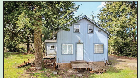
88336 Hwy 101 – Great opportunity to own a cute cottage in Florence with an extra lot behind it. Bring your tools and your ideas. 3 bdrm, 1 bath with 960 sqft and a total of .61 of an acre. Call for your personal viewing today! $147,500. #3144-20635134