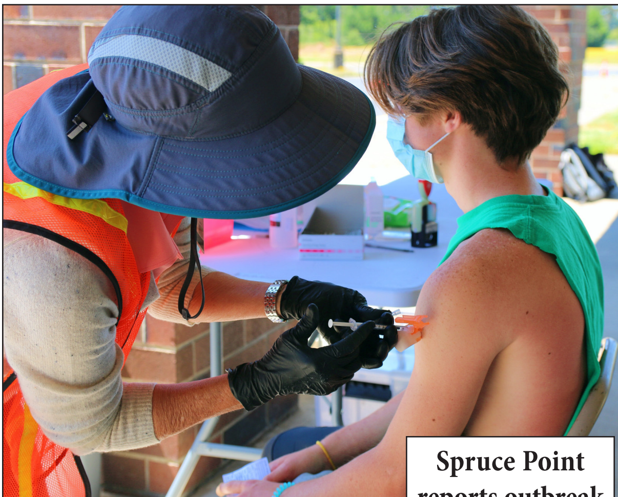
Multiple agencies have partnered with Lane County Public Health's COVID-19 Mobile Vaccine Team to bring a drive-through clinic to Siuslaw Middle School every three weeks.