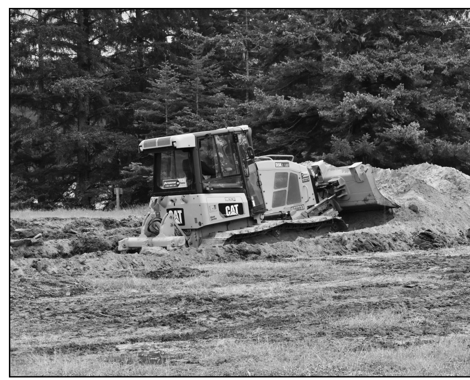
Youth from Camp Florence got to test heavy equipment as they practiced at the City of Florence's Quince Street site last week. Instructors were able to offer advice as they monitored the youth at work.

state-of-the-art CAT simulators. Upon successful completion of the simulation tests, the students moved to the field instructors for actual hands-on machine operation. For another week they practiced their skills in pre operation inspections, counterweight and positioning, trenching, loading, grading and more."