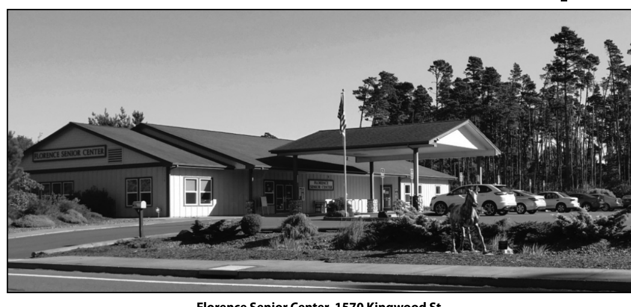
Florence Senior Center, 1570 Kingwood St.