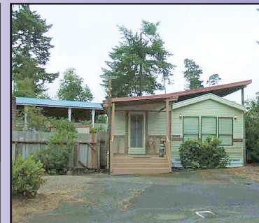
This is a unique property with a spacious addition of 2 large rooms and a utility room. There is a private, fenced patio area with an outdoor fire-place and a storage shed. $25.00 transfer fee to be paid by buyer at close of escrow. $165,000 #12155 MLS#21432860

Rare 4 bedroom, 3 bath home with 2348 SF. This custom built home has chalet features with vaulted ceilings, exposed beams and extensive cedar accents in the living and dining area. Floor to ceil-ing custom masonry fireplace. Bright kitchen area with open floor plan design features a large island and high end custom appliances. Oversized garage, covered patio, fence dog run with RV/Boat Parking too. Top of the hill with river views. Don't pass this beautiful home up! $510,900 #12163 MLS#21496104