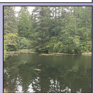
LITTLE WOAHINK LOT 119 nis peaceful & serene 1.01 acres Little oahink Lakefront lot is located on a secluded and private dead-end road Build your dream home among the trees. Septic approval is in the file. Walk the access trail from the road to the lake to view this one of a kind lot. $144,900 #11859 MLS#19669674

LEVAGE DRIVE town. This lot is raw land with lush green and wooded views. Filtered lake views may be possible with clearing at the top. Come build your dream home or enjoy your own forest. $25,000 #11916 MLS#19475920