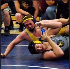
Wrestlers take to the mat INSIDE — B

RECORDS Obituaries & emergency response logs Inside — A2