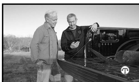
Good news for many Americans: Massive new moves to upgrade America's phones, homes and small towns to 5G.

•Great value. No added taxes or fees. No equipment fees. No contracts. No surprises or exploding bills. •Speed unlimited. With expected average speeds of 100 Mbps for most new customers, it'll handle all your home's needs, with unlimited data and no