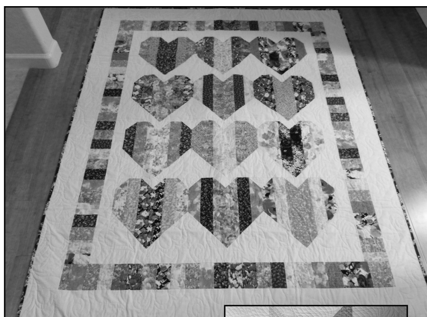
The Rhody Days Quilt show carries on this year at Old School Furniture.

Rhododendron Quilt Guild meetings are currently held at Crossroads Assembly of God Church, 1380 10th