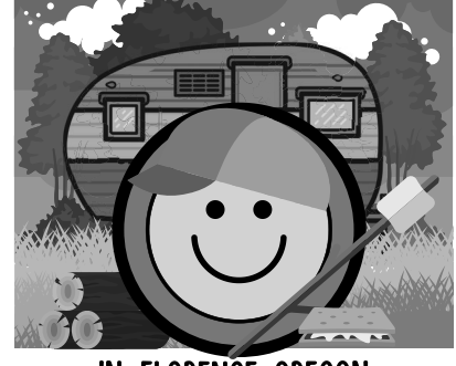
IN FLORENCE, OREGON