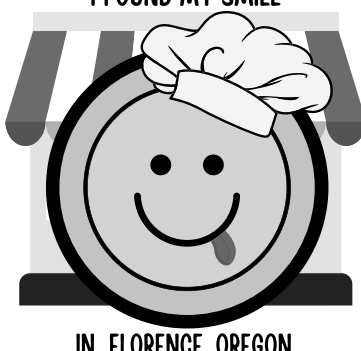
IN FLORENCE, OREGON