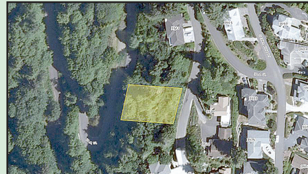
Ocean View Dr #11 – Buildable lot with spectacular views in Rhodo View Dunes Estates. Build your custom home in this gated community with all city services. CC&Rs ensure that all homes will be stick-built with a minimum of 1,350 square feet. $25,000. #2206-13021717