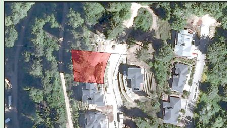
Jake Mann Lane #8700 – Ocean and valley views, southern exposure, and gorgeous sunsets, have captivated many homeowners living in Rhodo View Dunes Estates. This lot is ready to build, with all utilities to the lot line and paved road to the building site. $75,000. #1875-10028201