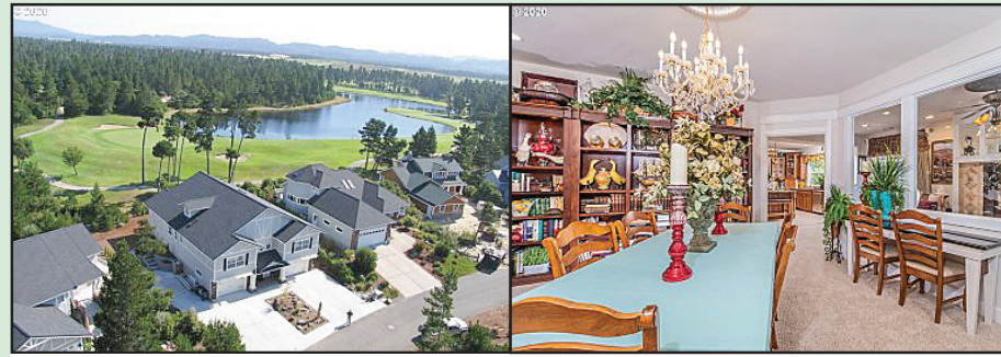
1035 Royal St Georges Dr – Fairway frontage and solid, well built home with great golf course views. This home is full of luxury amenities including stainless appliances and gas range, propane fireplace, an elevator, media/theater room, and expansive Trex deck overlooking the green. $850,000. #3137-20502246