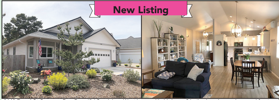
2143 Royal St Georges Dr – Beautiful Sandpines West home with 4 bdrms, 2 baths, laundry, a nd covered front and back patios. Quartz counters, white cabinets, vaulted ceilings and beautifully landscaped grounds, with a fenced area for pets and micro-drip system. $475,000. #3200-21074898