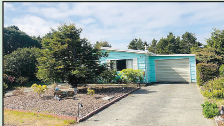
1600-431 Rhododendron Dr – This home boasts a great floor plan with ample daylight. Enjoy 2 bdrms, 2 baths, laundry, an oversized carport and two bonus work shop rooms. This property has two driveways which allows for ample parking, and a large backyard deck. $249,000. #3177-21600692