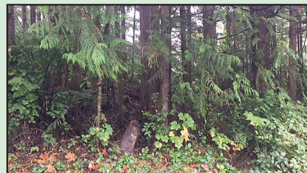
Cedar St #800 – Nice corner lot south of Florence near dunes, beach and town. Paved roads to this wooded lot with lots of possibilities. Quiet neighborhood with nice, newer homes around. Needs cleared and developed, so bring your ideas. Priced to sell! $29,900. #2785-17017018