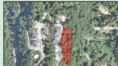
Ocean View Drive #8100 – 1.25 acre hillside building site in upscale Rhodo View Dunes Estates. Homesite offers views of North Fork Siuslaw slough. Potential to divide and develop lots, utilities available. $35,000. #1879-10004463