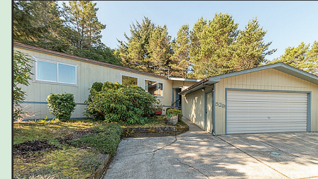
1601-529 Rhododendron Dr – A fully furnished gem in Greentrees Village. The home features a secluded backyard area that buffers up against the hillside, giving you privacy just minutes from the beach. Make this your forever home or your coastal escape. $295,000. #3184-21619735