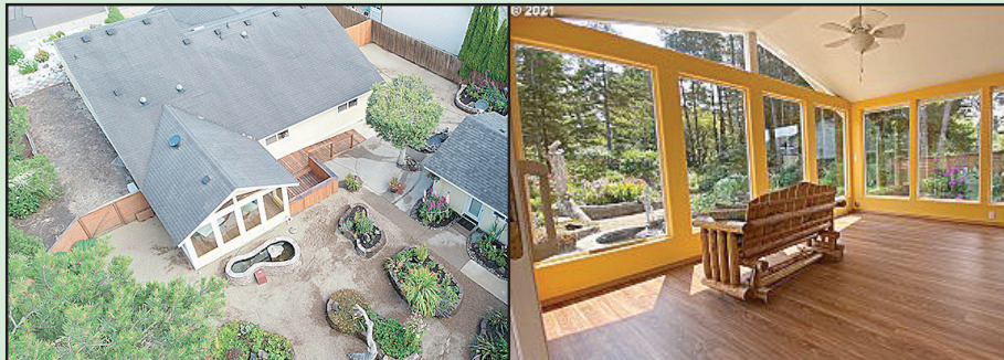
4104 Munsel Creek Dr – Versatile, unique and convenient. Over 4,000 sqft of living space provided by two turn-key homes, separated by a colorful garden. Main floor living, roll-in shower, security system $700,000 #3186-21117076