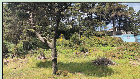
4th Avenue #106 – Nice beach area lot with water and power services at the lot line. With a little clearing this lot could be ready for your new home. Walking distance to the beach and minutes to town. Bring your toys and enjoy your little gem on the coast! $55,000. #2995-19651615