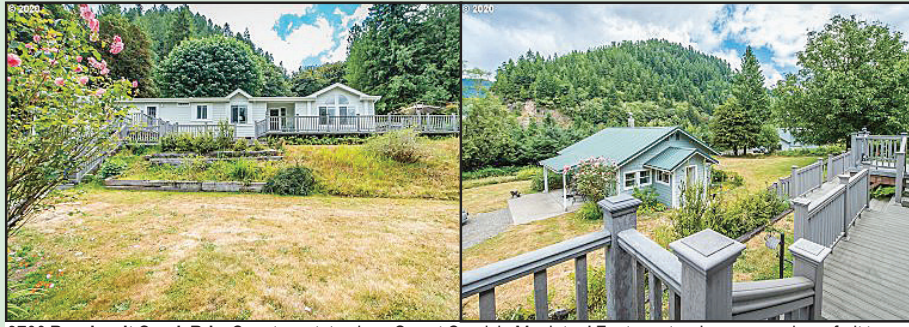
9700 Bernhardt Creek Rd – Country estate along Sweet Creek in Mapleton! Features two homes, gardens, fruit trees, barn, and private dock. Main home is 3230 sqft with an infinity pool and large wrap-around decks. The cabin comes fully furnished and is 940 sqft. $989,000. #3121-20170603