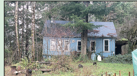
91781 Deadwood Creek Rd – Late 1800s School House, bring your skills and restore this treasure. Several studio out buildings to use for friends, family or art studios. Enjoy the landing or hot tub alongside the creek that flows by the house and one of the cabins. $260,000. #3169-20121086