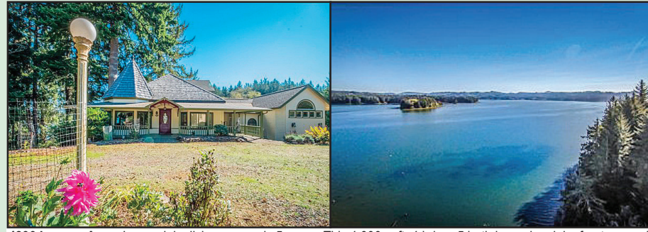
4836 Laguna Ave – Luxury lake living on nearly 5 acres. This 4,000 sqft, 4 bdrm, 5 bath home has lake frontage and views with private dock. Hardwood floors, gourmet kitchen, high ceilings, and large master suite. Oversized 3 bay RV barn with shop and office. $1,350,000. #2850-21052853