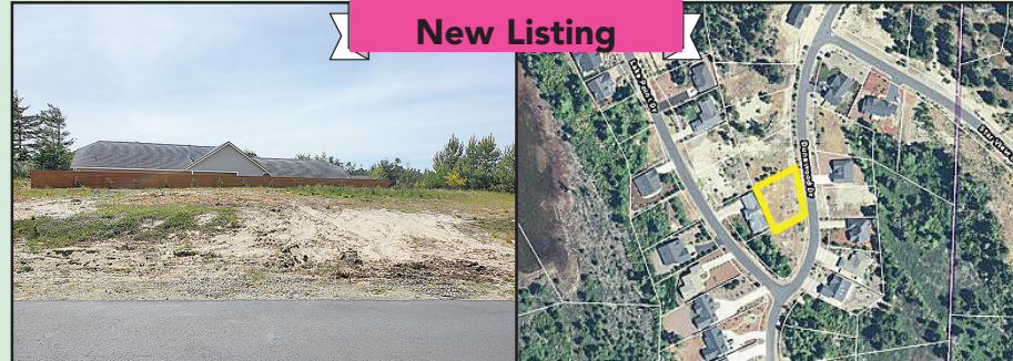
Dunewood Dr #76 – Cleared, level lot overlooking natural areas, with deeded lake and nature preserve access. Beautiful new development with curving streets, underground utilities and Heceta Water. $115,000. #3045-21086875