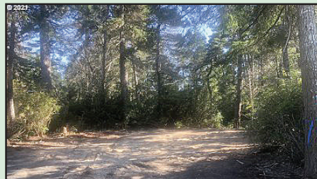
Spruce St #100 – In-town property with utilities at the street. Munsel Creek runs along the property. Check with the City of Florence and build your Coastal Getaway. $42,500. #3190-21364581