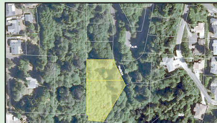
Maple Lane #6 – Lovely .29 acre home site in gated Rhodo View Dunes Estates with full city services. Beautiful wooded lot on a cul-de-sac, ready for your dream home. $19,995. #2210-13084475