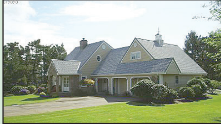
28 Ocean Dunes Dr – Custom Cape Cod home with views of the 18th green. Great room with pass-thru fireplace from kitchen to den. 2 master suites and guest room with full bath, home theater and rec room. Lot 27 is included and is the last buildable lot in Ocean Dunes. $950,000. #3124-20557608