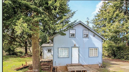
88336 Hwy 101 – Great opportunity to own a cute cottage in Florence with an extra lot behind it. Bring your tools and your ideas. 3 bdrm, 1 bath with 960 sqft and a total of .61 of an acre. Call for your personal viewing today! $175,000. #3144-20635134