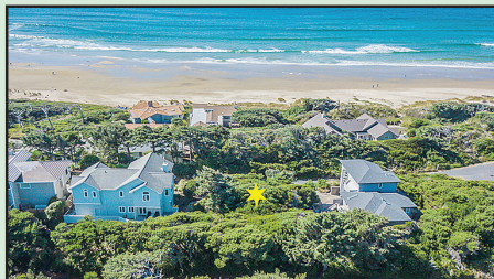
Shoreline Dr #131 – Wonderful ocean views on buildable land in the Kila-Ha-Nee development. A private gated community of high-end oceanfront and ocean view homes. Walk to the ocean, breathe the fresh air, and take in the natural beauty. Utilities at the lot line; septic approved. $268,500. #3138-20332598