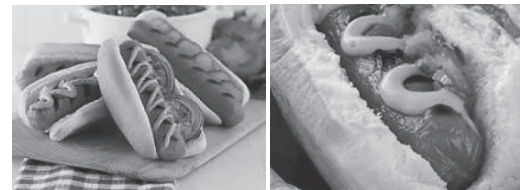
All proceeds to stay in Florence and help those in need of a free meal.

Date: May 15, 2021 Time: 11:00 am to 2:00 pm Location: Grocery outlet parking lot