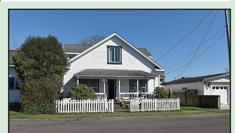
238 Oak St – Fantastic location in Old Town and just a block from the river! Home features 3 bdrms, 2 baths, plus 2 bonus rooms for a total of 5 possible bdrms! Bring your ideas and turn this unique, turn of the century home into your home or an income property. $359,000. #3181-