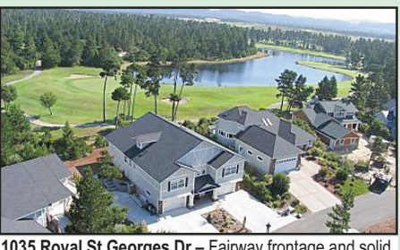
1035 Royal St Georges Dr – Fairway frontage and solid, well built home with great golf course views. This home is full of luxury amenities including stainless appliances and gas range, propane fireplace, an elevator, media/theater room, and expansive Trex deck overlooking the green.