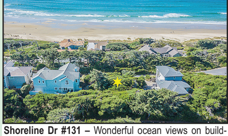
Shoreline Dr #131 – Wonderful ocean views on buildable land in the Kla-Ha-Nee development. A private gated community of high-end oceanfront and ocean view houses. Walk to the ocean, breathe the fresh air, and take in the natural beauty. Utilities at the lot line; septic approved. $268,500. #3138-20332598