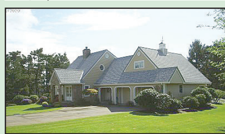
28 Ocean Dunes Dr – Custom Cape Cod home with views of the 18th green. Great room with pass-thru fireplace from kitchen to den. 2 master suites and guest room with full bath, home theater and rec room. Lot 27 is included and is the last buildable lot in Ocean Dunes. $950,000. #3124-20557608