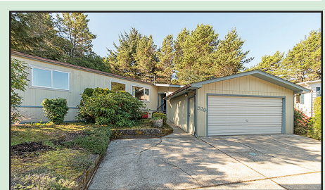
1601-529 Rhododendron Dr – A fully furnished gem in Greentrees Village. The home features a secluded backyard area that buffers up against the hillside, giving you privacy just minutes from the beach. Make this your forever home or your coastal escape. $295,000. #3184-21619735