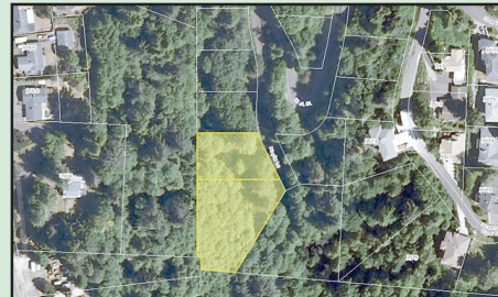
Maple Lane #6 – Lovely .29 acre home site in gated Rhodo View Dunes Estates with full city services. Beautiful wooded lot on a cul-de-sac, ready for your dream home. $19,995. #2210-13084475