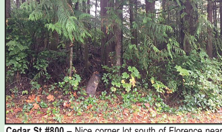
Cedar St #800 – Nice corner lot south of Florence near dunes, beach and town. Paved roads to this wooded lot with lots of possibilities. Quiet neighborhood with nice, newer homes around. Needs cleared and developed, so bring your ideas. Priced to sell! $29,900. #2785-17017018