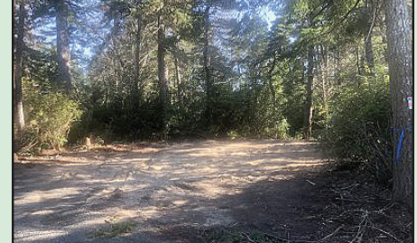
Spruce St #100 – In-town property with utilities at the street. Munsel Creek runs along the property. Check with the City of Florence and build your Coastal Getaway. $42,500. #3190-21364581