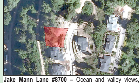
Jake Mann Lane #8700 – Ocean and valley views, southern exposure, and gorgeous sunsets, have captivated many homeowners living in Rhodo View Dunes Estates. This lot is ready to build, with all utilities to the lot line and paved road to the building site. $75,000. #1875-10028201