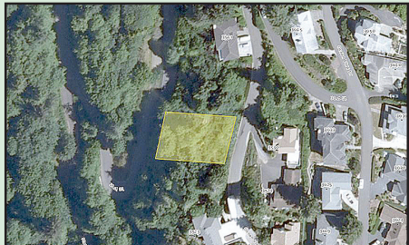
Ocean View Dr #11 – Buildable lot with spectacular views in Rhodo View Dunes Estates. Build your custom home in this gated community with all city services. CC&Rs ensure that all homes will be stick-built with a minimum of 1,350 square feet. $25,000. #2206-13021717