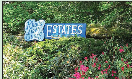
Ocean View Drive #8100 – 1.25 acre hillside building site in upscale Rhodo View Dunes Estates. Homesite offers views of North Fork Siuslaw slough. Potential to divide and develop lots, utilities available. $35,000. #1879-10004463