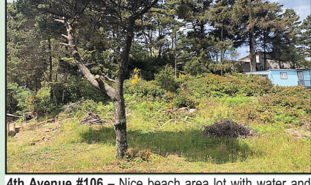
4th Avenue #106 – Nice beach area lot with water and power services at the lot line. With a little clearing this lot could be ready for your new home. Walking distance to the beach and minutes to town. Bring your toys and enjoy your little gem on the coast! $55,000. #2995-19651615