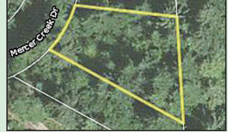
Mercer Creek Dr #00148 – Nice, wooded .32 acre lot near Sutton Lake in an area of fine homes. This wonderful North Lakes area lot is waiting to be developed and built on. Property has mature trees and native vegetation. Water and power available. $64,900. #2597-16420336