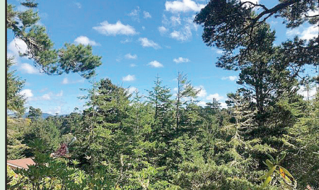
91 Windleaf Way – This is a great opportunity to build your home close to the beach, in a great community of very nice homes. $63,000. #2797-18615048