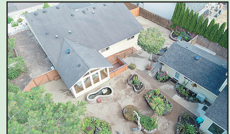
4104 Munsel Creek Dr – Versatile, unique and convenient. Over 4,000 sqft of living space provided by two turn-key homes, separated by a colorful garden. Main floor living, roll-in shower, security system $700,000 #3186-21117076