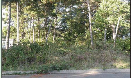
37th Street #1300 – Convenient in-town lot. Level and ready for a multi-family dwelling in this established neighborhood. $65,000. #1978-10080860