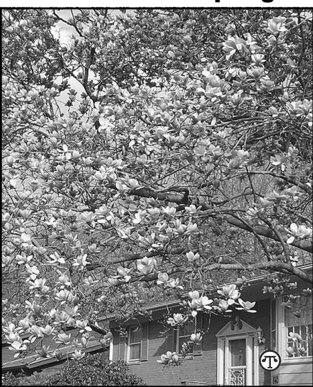
When Spring arrives it's time to have your heating and cooling air ducts cleaned.

(NAPSI)—Spring isn't just when we spring forward in time, it is also the time when we spring into action to clean those places that likely haven't been cleaned at all: your heating and cooling air ducts.