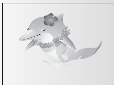
National Dolphin Day April 14, 2021