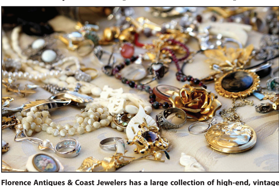
and estate jewelry, along with newer pieces and other antiques.

Coast Jewelers, 1220 Bay St. new." #100 in Historic Old Town Florence, reopened to the on throughout the month. noon to 5 p.m. Wednesday public on April 1.