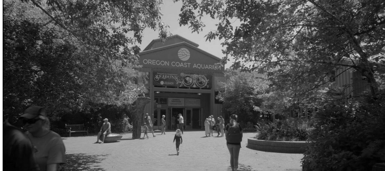
People can visit the Oregon Coast Aquarium, 2820 S.E. Ferry Slip Rd., Newport, now.

To make special accommodation arrangements,