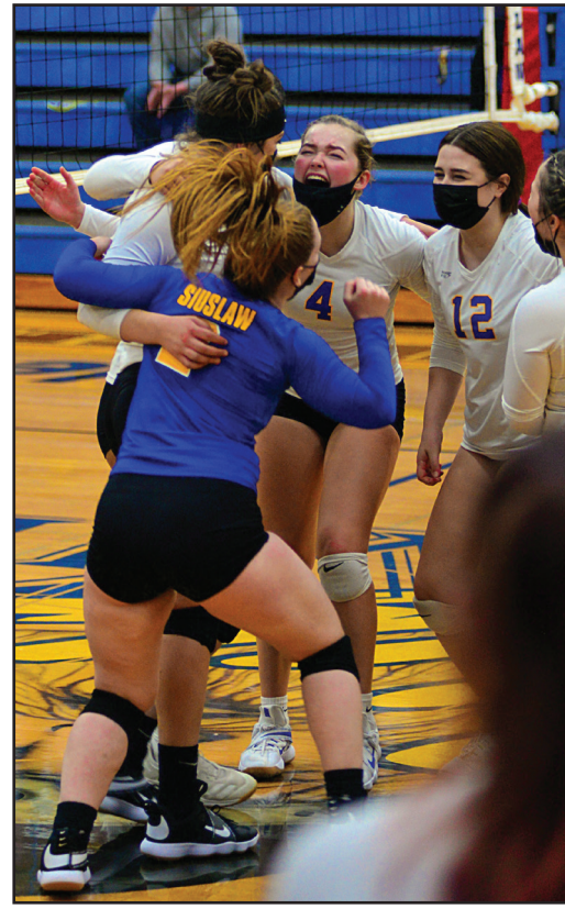
The Lady Vikings celebrate after defeating Cottage Grove in four sets Thursday night.